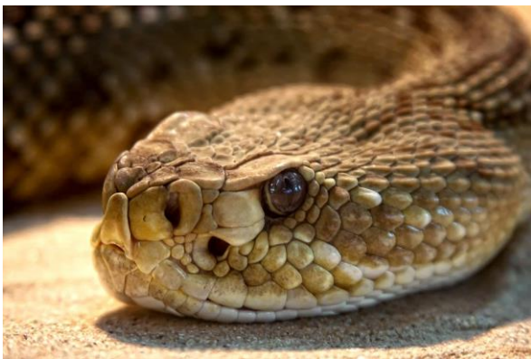
5. Rattle Snake