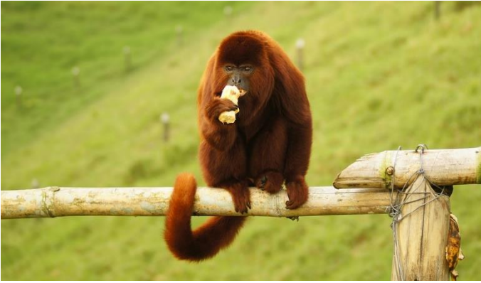
1. Howler Monkey