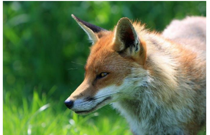
20. Red Fox