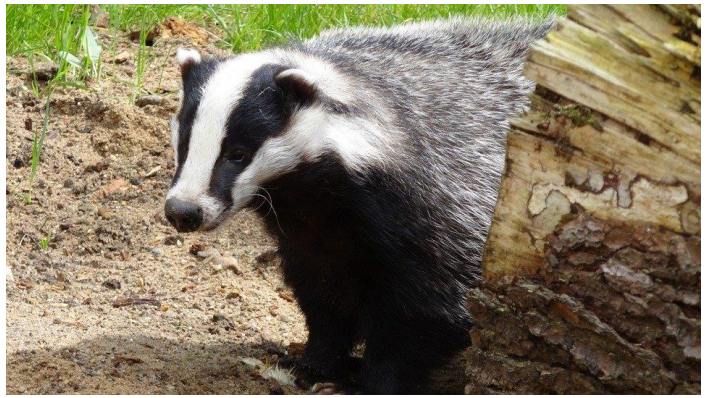
10. European Badger