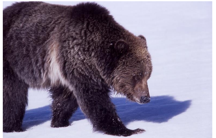
18. Grizzly Bear